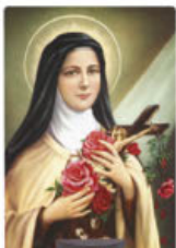
ST. THERESE OF LISEUX

OUR MEETING TIMES THIS YEAR ARE: MONDAYS FROM 6:30PM-8:00PM (TWICE A MONTH) SATURDAY FROM 9:00AM-12:00PM (ONCE A MONTH)