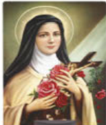
ST. THERESE OF LISEUX

OUR MEETING TIMES THIS YEAR ARE: MONDAYS FROM 6:30PM-8:00PM (TWICE A MONTH) SATURDAY FROM 9:00AM-12:00PM (ONCE A MONTH)